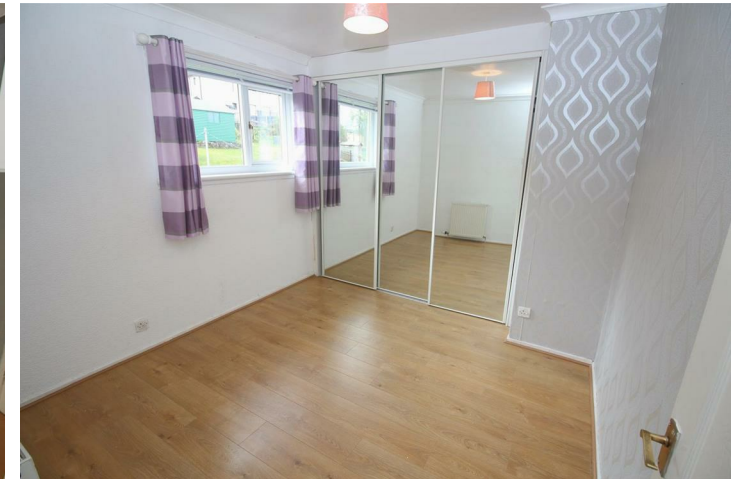
Bathroom 6'4" x 5'7" (1.95 x 1.71)