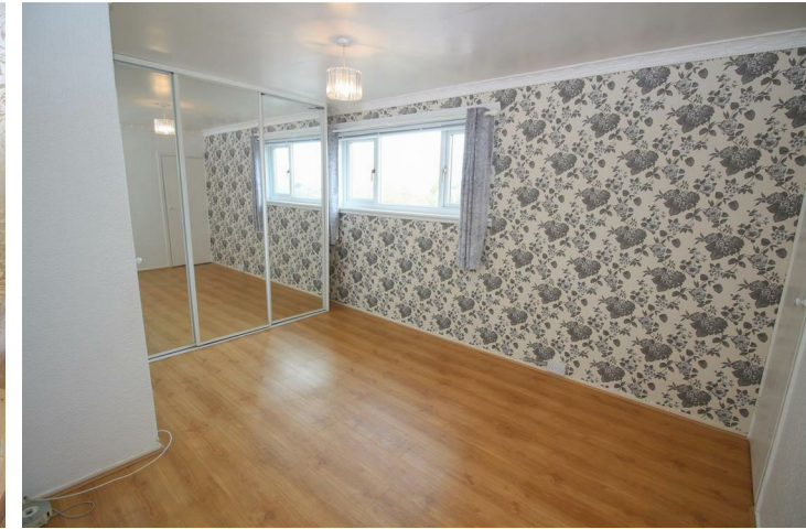
Bedroom 2 9'10" x 9'2" (3.02 x 2.81)