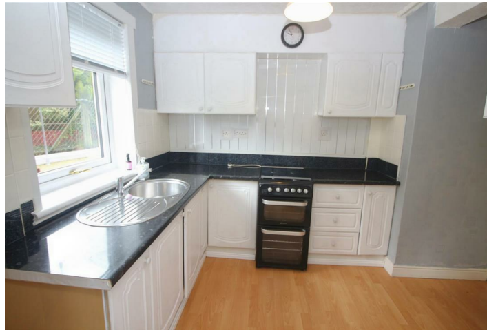
Bedroom 1 15'1" x 10'2" (4.62 x 3.12)